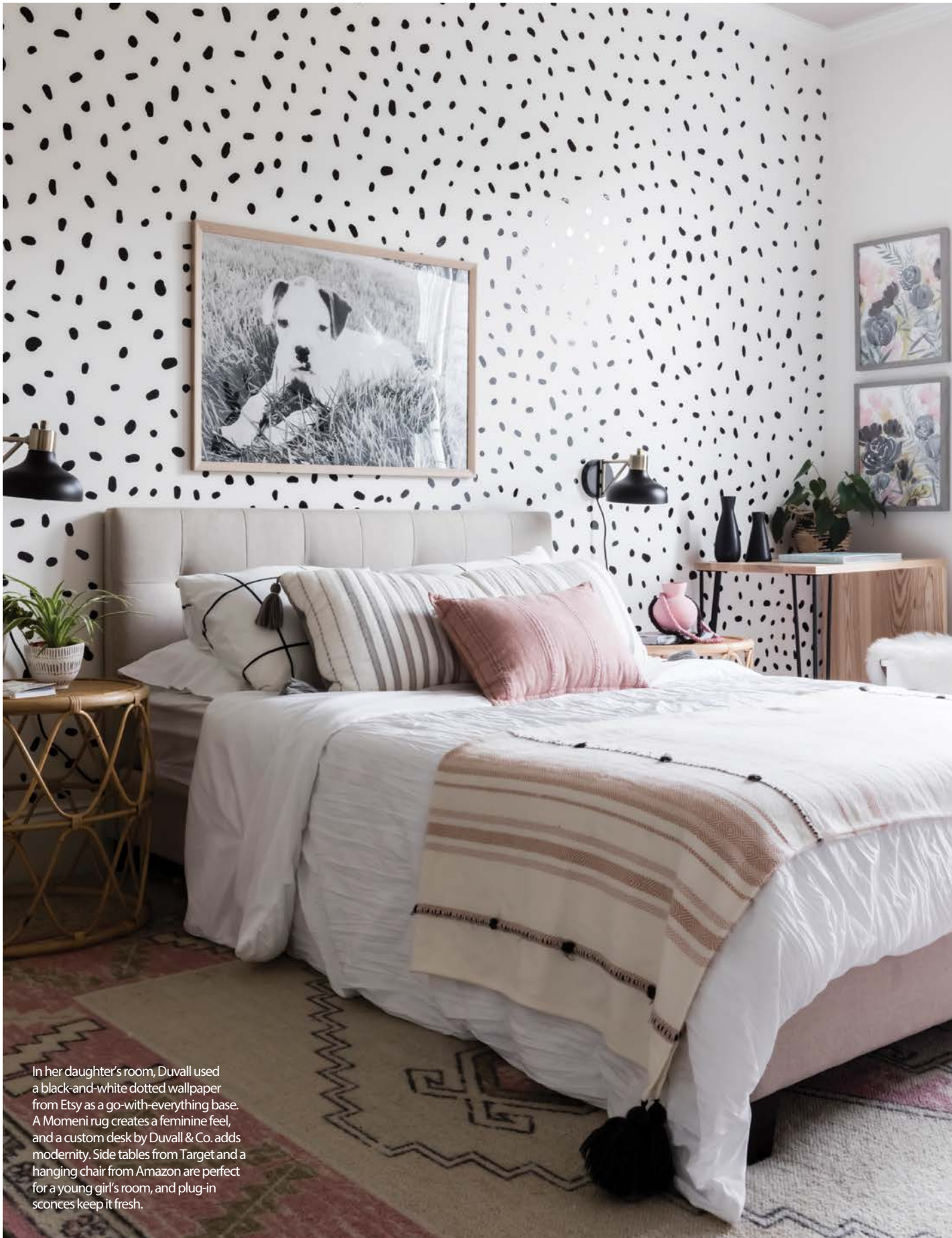
In her daughter's room, Duvall used a black-and-white dotted wallpaper from Etsy as a go-with-everything base. A Momeni rug creates a feminine feel, and a custom desk by Duvall & Co. adds modernity. Side tables from Target and a hanging chair from Amazon are perfect for a young girl's room, and plug-in sconces keep it fresh.